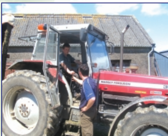
Instructing young people is crucial for safety.

When children have to be carried in the cab, it must be fitted with a properly designed and fitted passenger seat with seat belts.