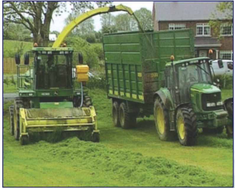
Safety vigilance is necessary, especially when high-risk work is in progress

Children may be tempted to climb on gates or wheels, particularly large tractor wheels. Gates and pillars should be properly erected so they don't fall over. Tractor wheels should be stored on the flat or, if upright, should be firmly secured.