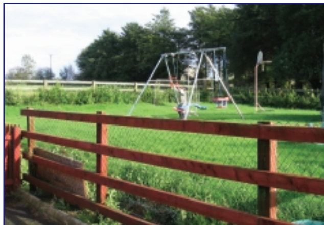
Provide a secure and safe play area for young children

Children under 14 should not be allowed to drive or operate tractors or machinery. Children over 14 should be allowed to operate tractors only after they have received formal training (see section 17 on competence and training for people at work in agriculture).